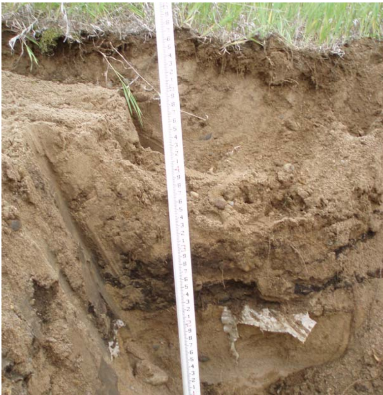
Photo 6 Former Lagoon Liner at SOC3-TT2