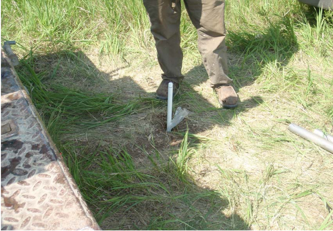
Photo 17 Temporary well at SOC3-GP2