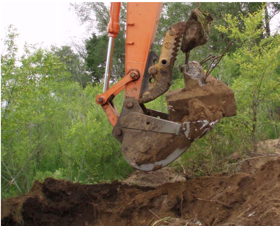
Photo 8 Debris at SOC3-TT9. Debris encountered during excavation included concrete, metal, and ceramic.