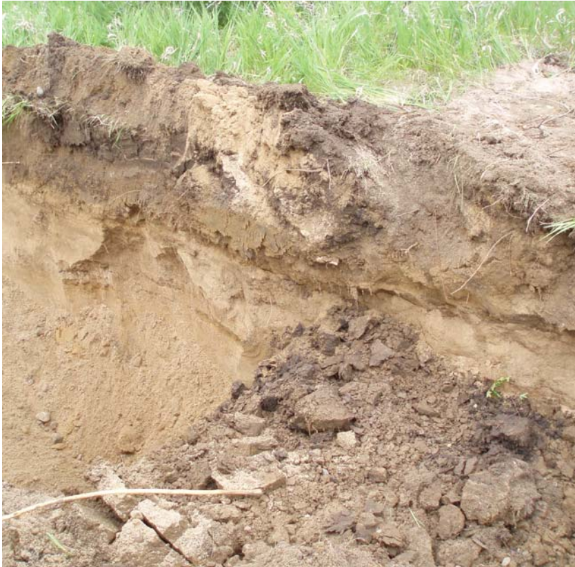
Photo 7 Fill at SOC3-TT10