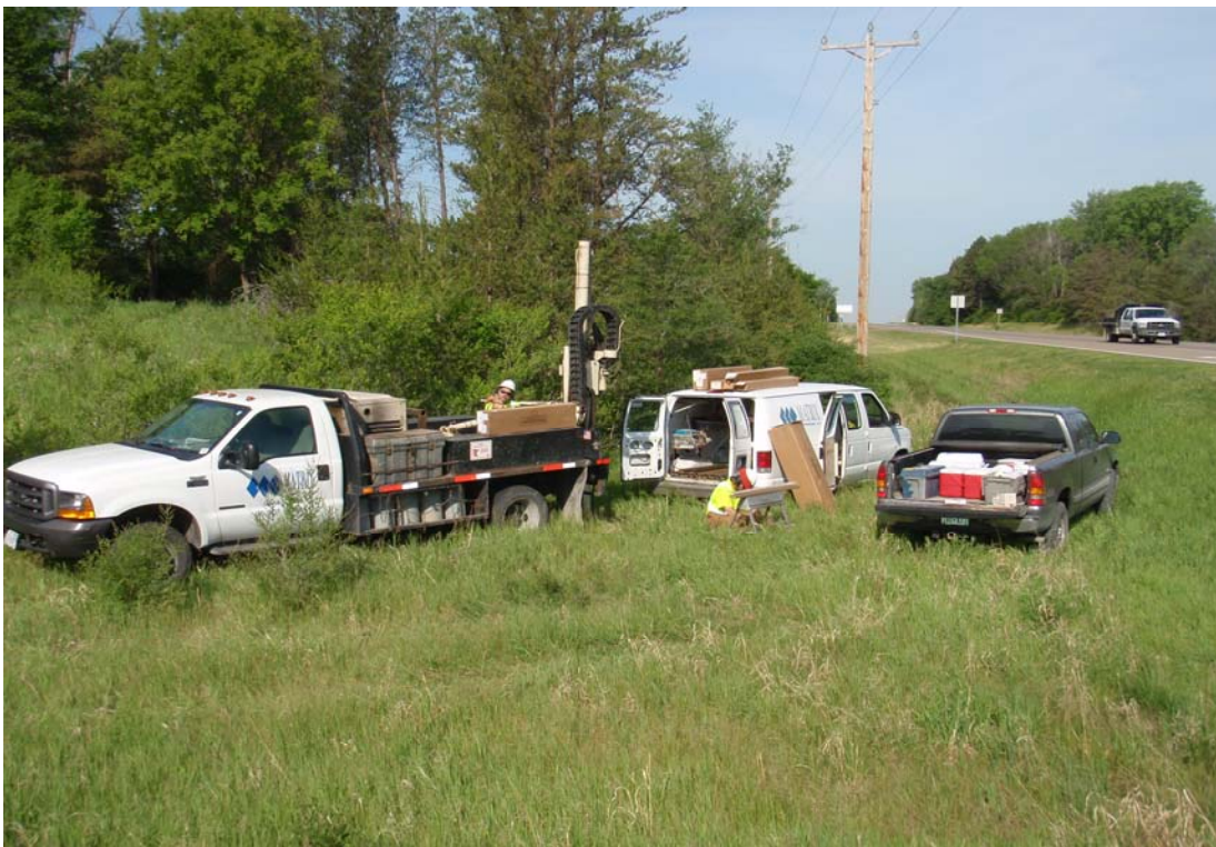
Photo 14 Setup at SOC3-GP2