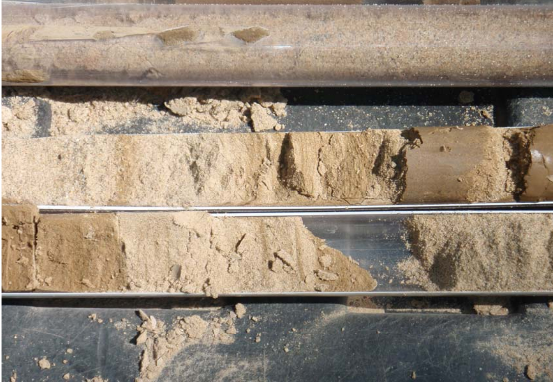
Photo 15 Lacustrine deposits at SOC1-GP1