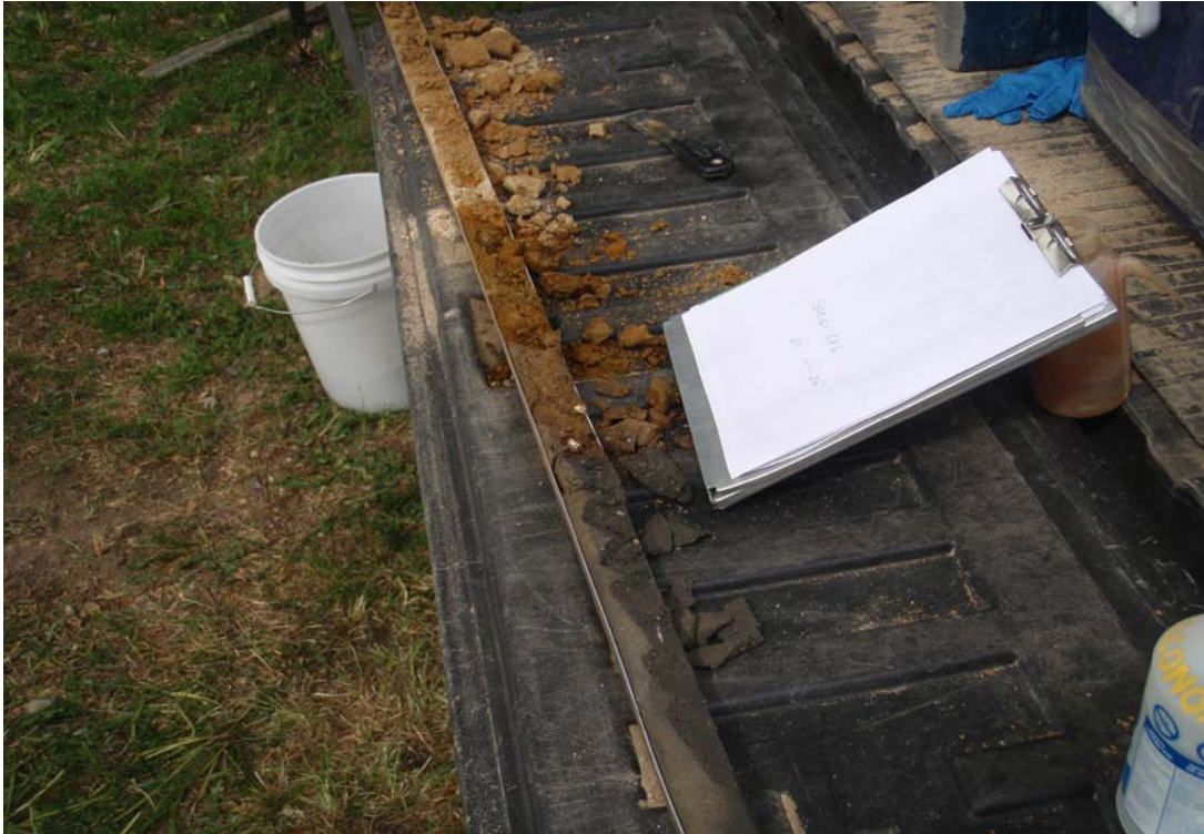
Photo 11 Diamicton till at SOC6-GP6