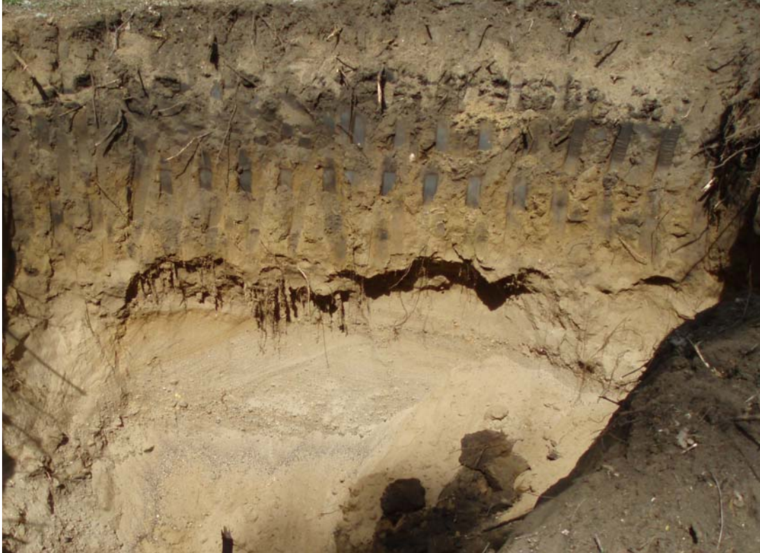
Photo 3 SOC3-TT16 Sidewall