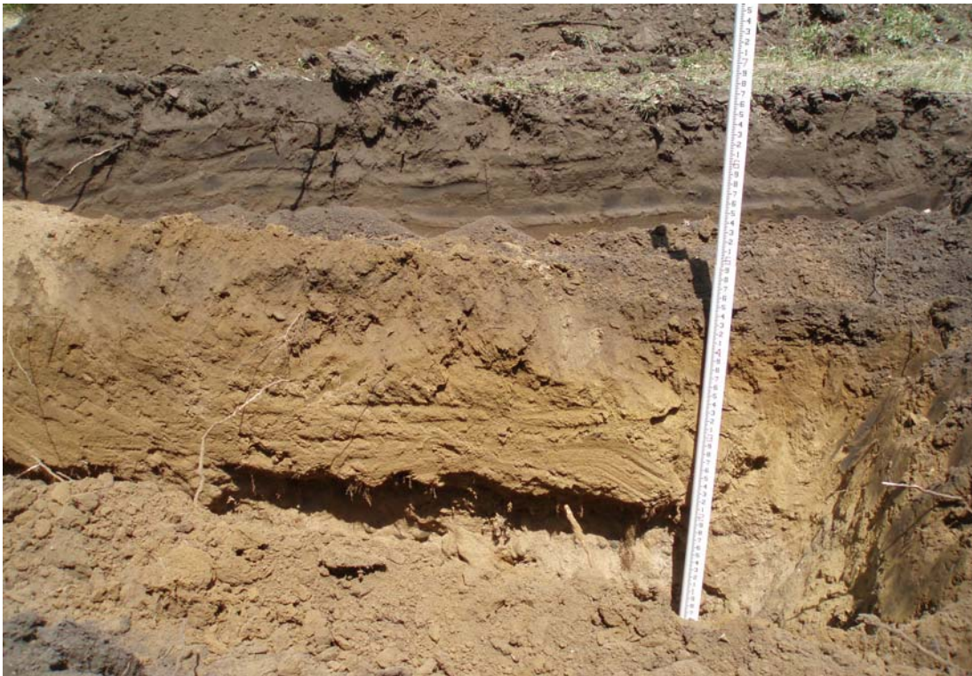
Photo 2 SOC2-TT5 Sidewall