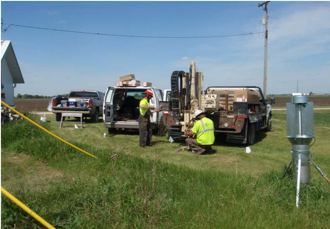
Photo 9 Setup at SOC6-GP4