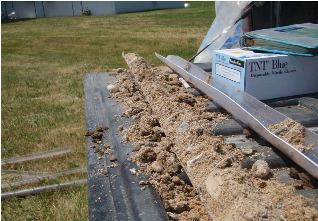
Photo 12 Outwash at SOC3-GP3