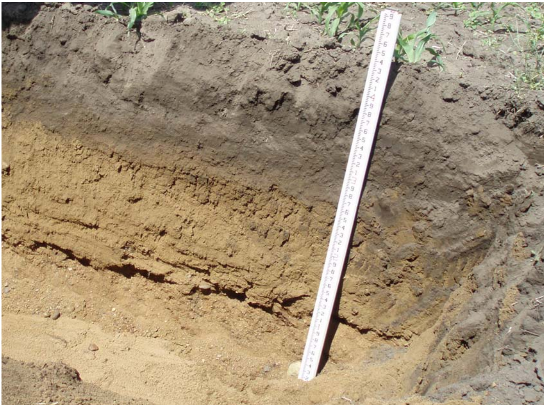
Photo 4 SOC8-TT5 Sidewall