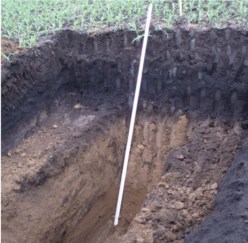
Photo 5 SOC7-TT4 Sidewall