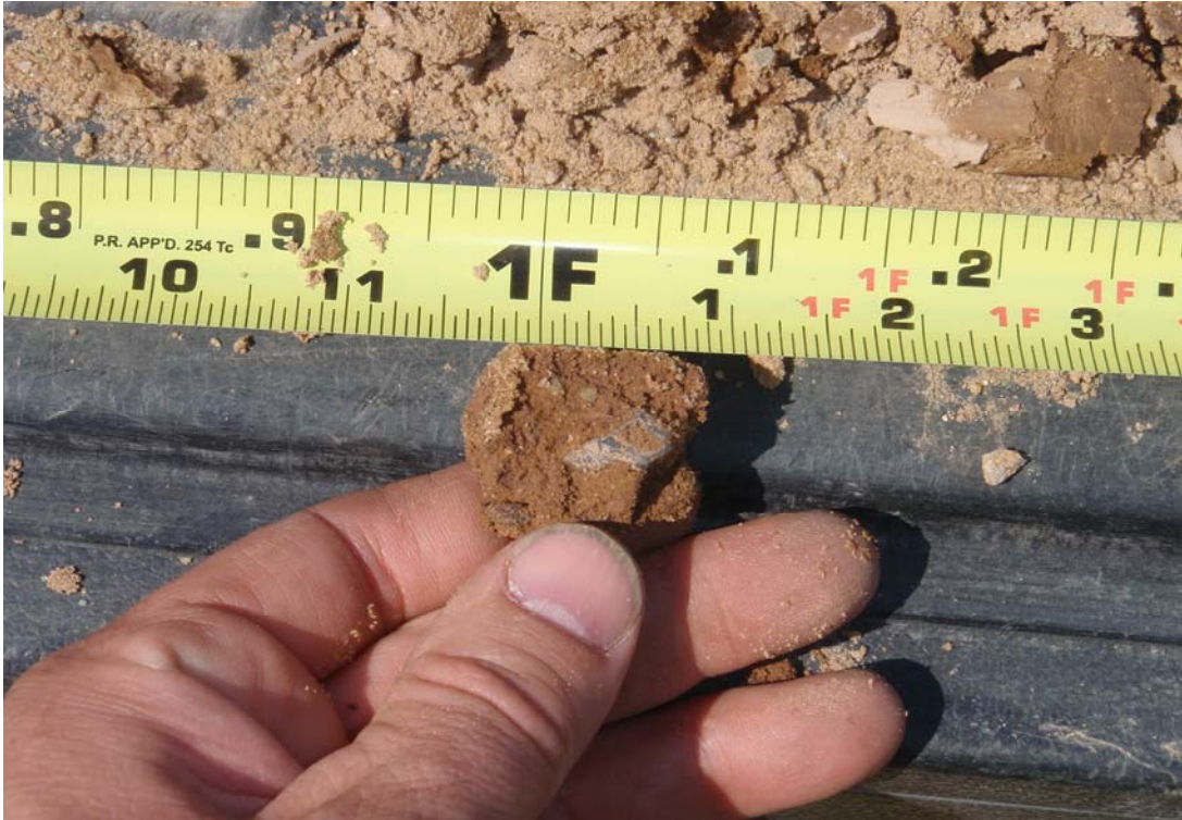
Photo 13 Diamicton till at SOC3-GP3