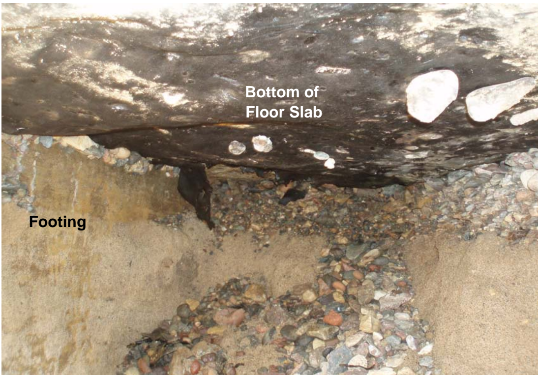
Photo 9 Tar coating and poorly graded gravel layer below the floor slab at DNT storage bunker 260-H (Bld. 604).