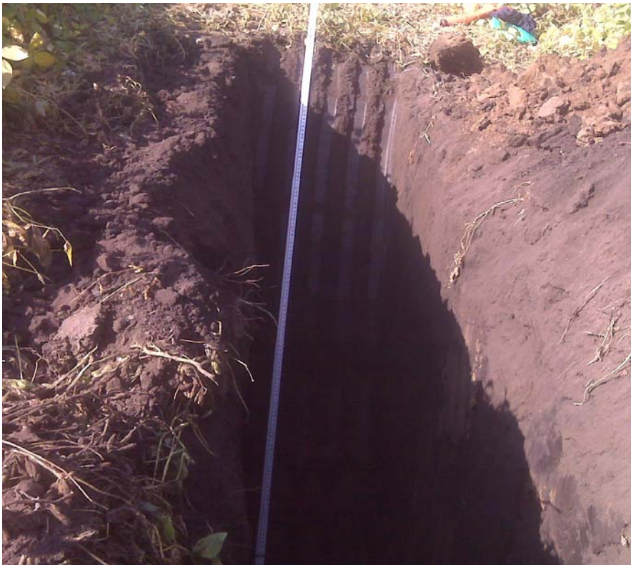
Photo 6 Test trench SOC4-TT12. Analytical soil sample SOC4-TT12-0.5' was collected from 0.5 feet below ground surface in this test trench.