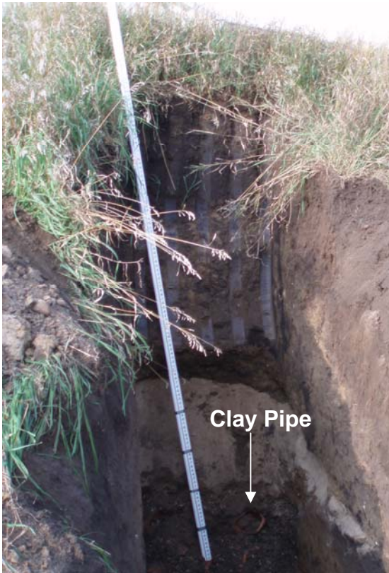
Photo 7 Test trench SOC5-TT17.