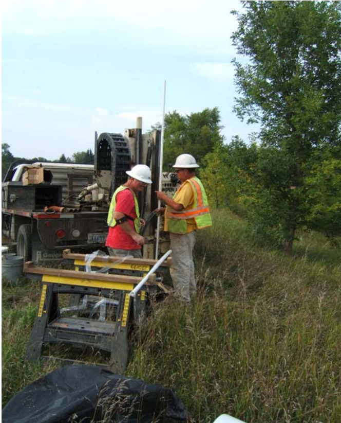
Photo 13 Temporary well installation at SOC4-GP1