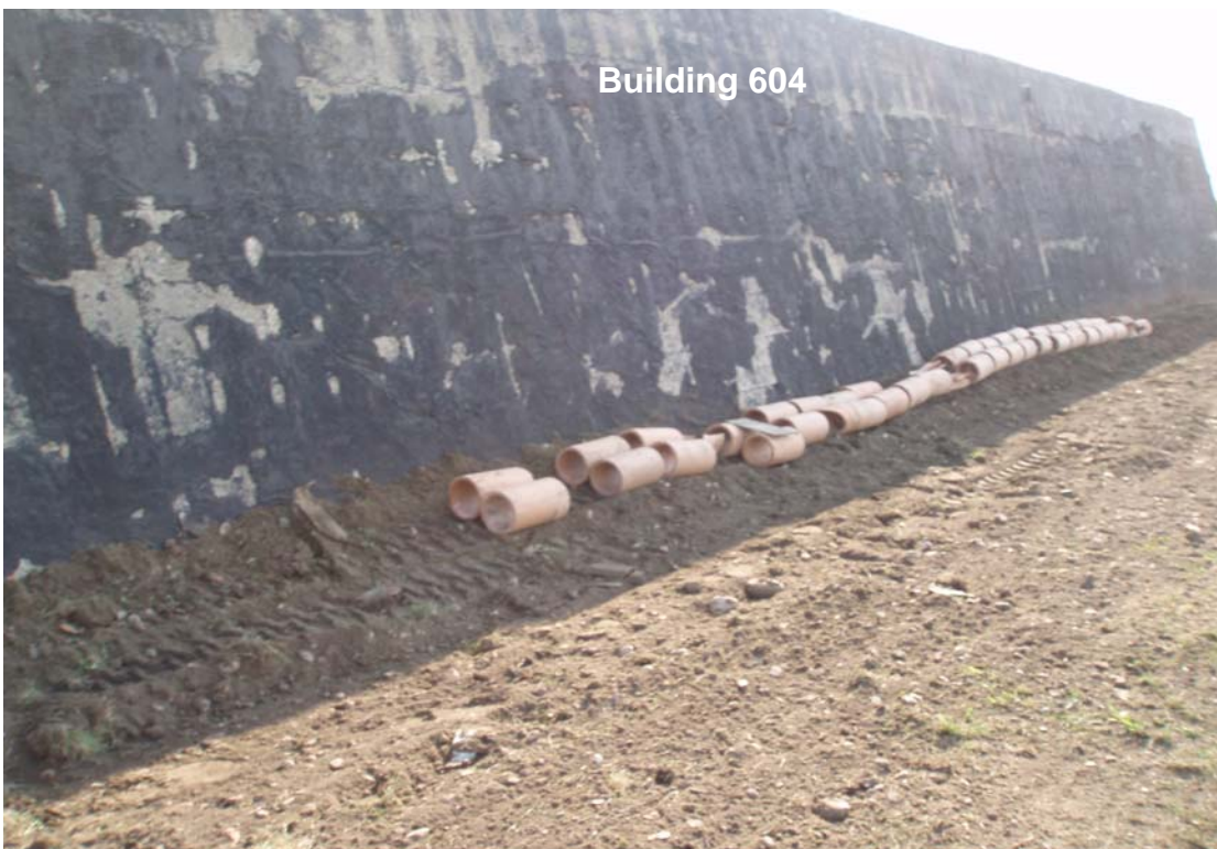
Photo 8 Tar coating on DNT storage bunker 260-H (Bld. 604) and drainage tile removed from the perimeter of the building.