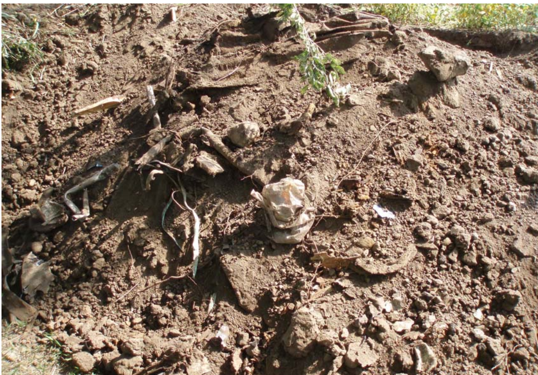
Photo 3 Spoil pile from test trench SOC4-TT9. Debris encountered included concrete, plastic, metal, glass, ash, shingles and tiles.