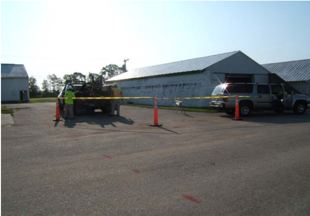
Photo 11 Work zone delineation at SOC5-GP6