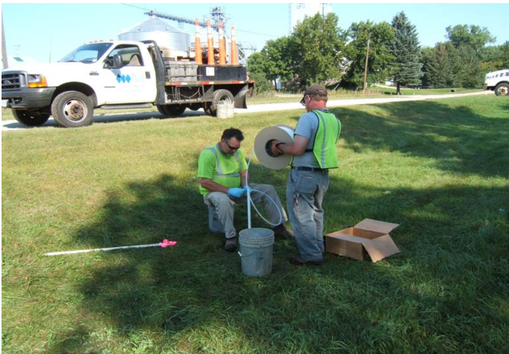
Photo 16 Groundwater sampling at SOC5-GP3