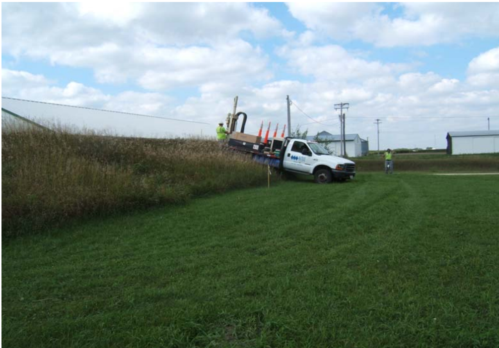
Photo 15 Drilling on the DNT storage bunker berm at SOC5-GP21