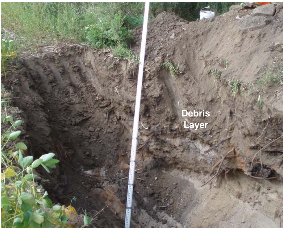
Photo 2 Test trench SOC4-TT9, debris encountered.