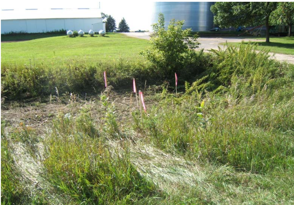
Photo 14 Pesticide sampling borings at SOC5-GP13, locations A through D