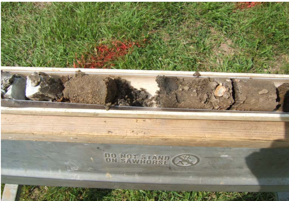
Photo 12 Stained soils at SOC5-GP8