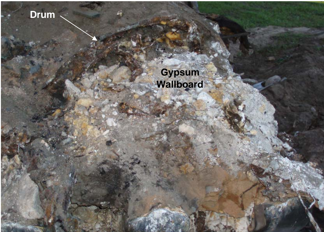
Photo 5 35-gallon drum containing gypsum wallboard found in test trench SOC4-TT9B.