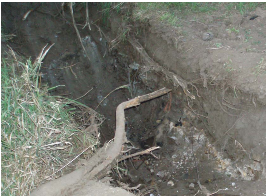
Photo 4 Test trench SOC4-TT9B, debris encountered.