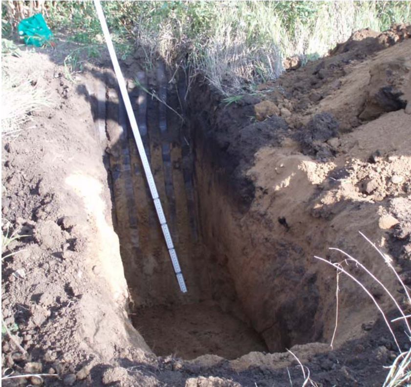
Photo 1 Test trench SOC4-TT1.