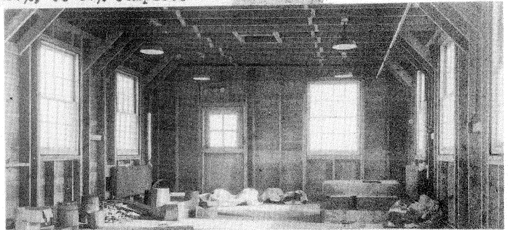
AREA SHOPS BUILDINGS NO. 722A-Y(Acid), C(Nitrocel). Nos. 722A-Y-99%, C-100% Complete