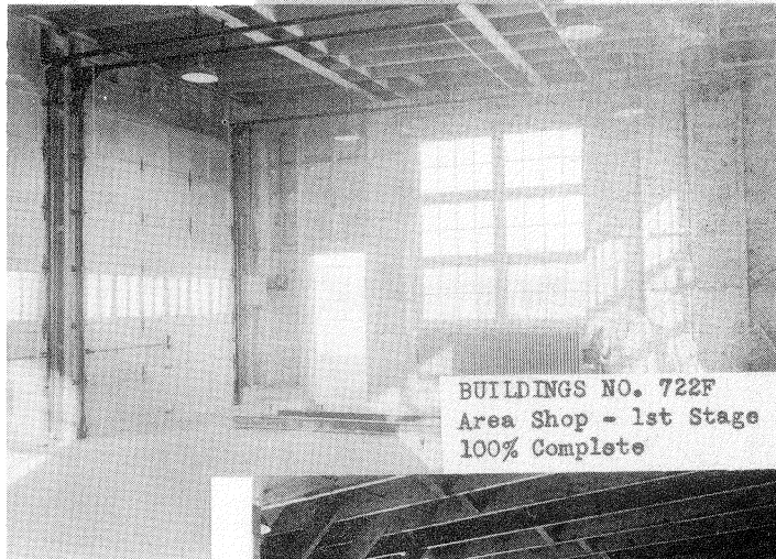
BUILDINGS NO. 722F Area Shop - 1st Stage 100% Complete