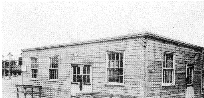
AREA SHOPS BUILDINGS NO. 722A-G-Y-GG(Acid), C(Nitrocel), F-FF(1st Stage), M(Organics) N-P(Finishing Stage), CC(Nitrocellulose). Nos. 722A-Y-99%, G-GG-96%, C-F-N-100%, FF-83%, M-98%, P-97%, CC-87% Complete