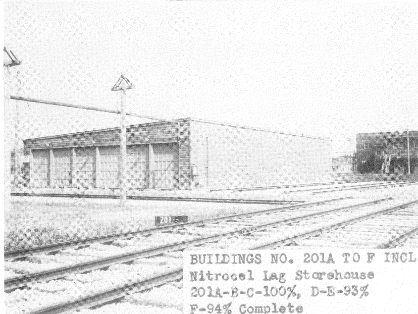
BUILDINGS NO. 201A TO F INCL. Nitrocel Lag Storehouse 201A-B-C-100%, D-E-93% F-94% Complete