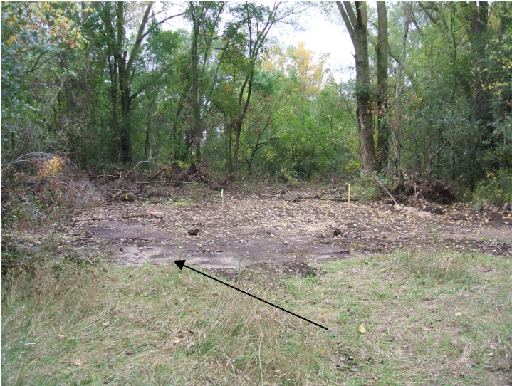
9/23/06: view facing south of concrete drive and test trench locations.