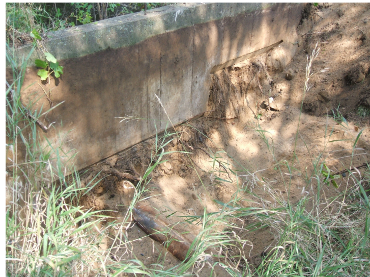
9/7/06: building footing along test trench 29 located along southern wall of the building and a steel pipe.