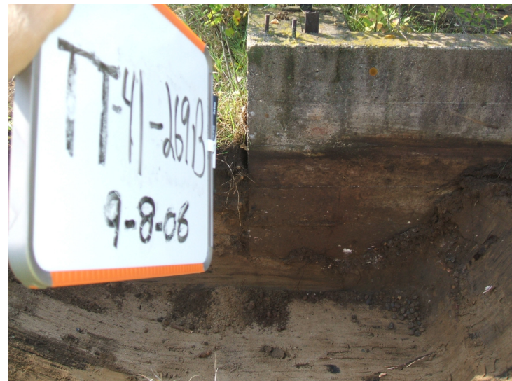
9/8/06: dry well material in test trench 42 (test trench number in photo wrong) located on northeast corner of the building.