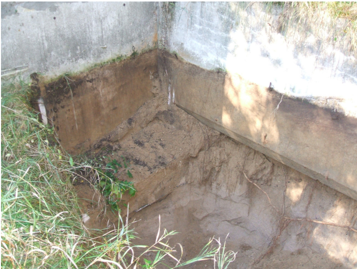
9/8/06: test trench 40 located on southeast corner of building.