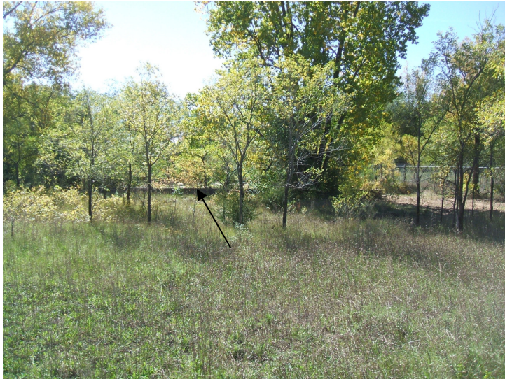
9/25/06: view facing south of concrete building remnants.