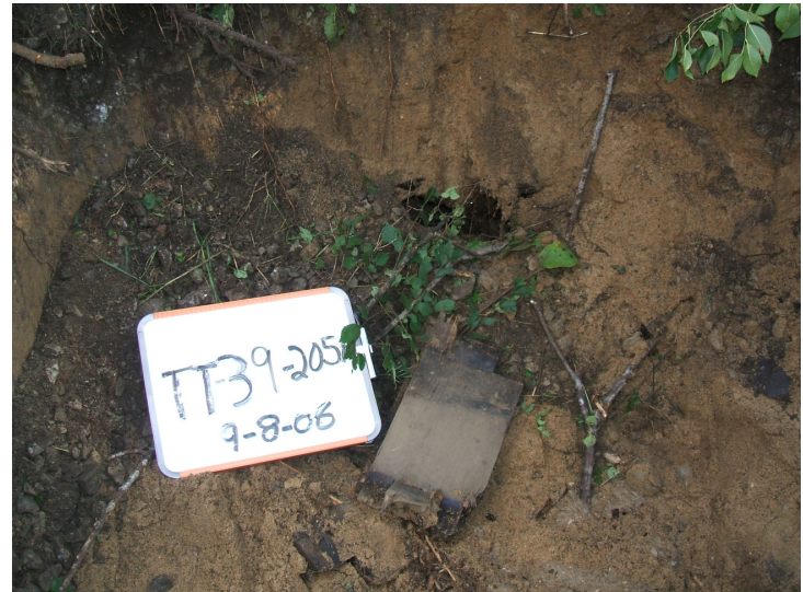
9/8/06: piece of wood box drain in test trench 39 located just east of the east building wall.