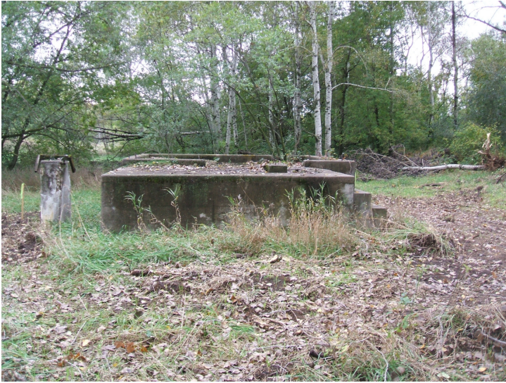
9/23/06: view facing east of the concrete building pad.