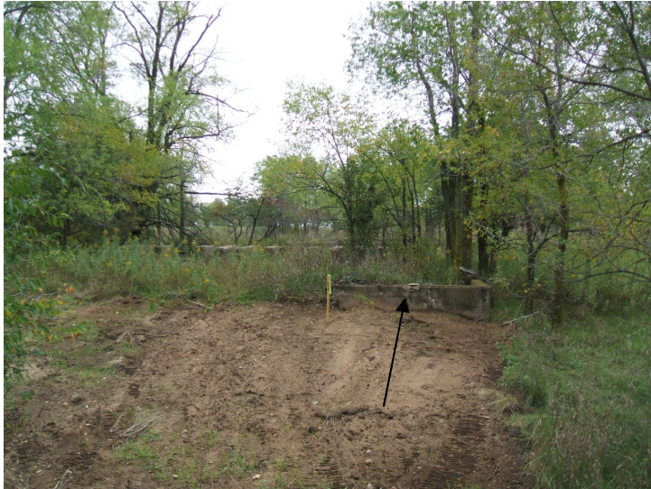
9/23/06: view facing north of the concrete building pad.