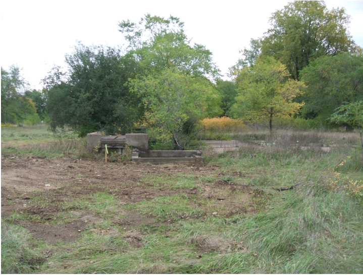
9/23/06: view facing east of the concrete building pad.