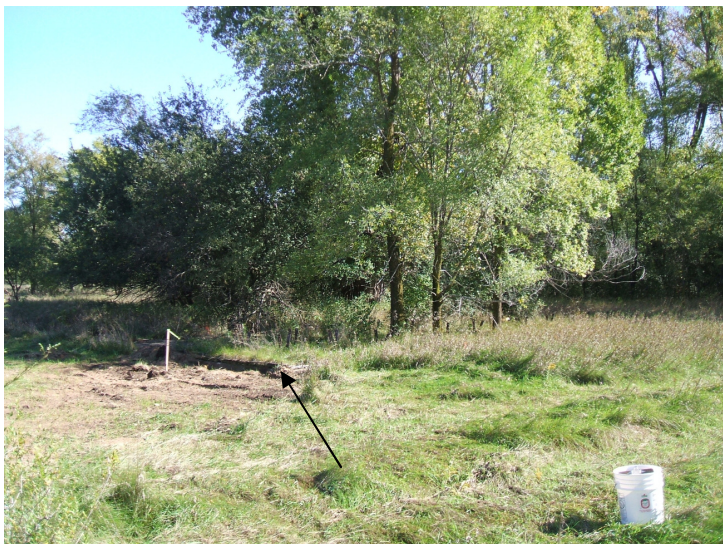
9/24/06: view facing northeast of concrete building pad hidden by trees.