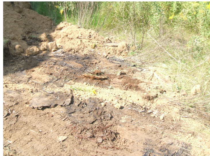
9/7/06 possible ACM on the surface at test trench 30.