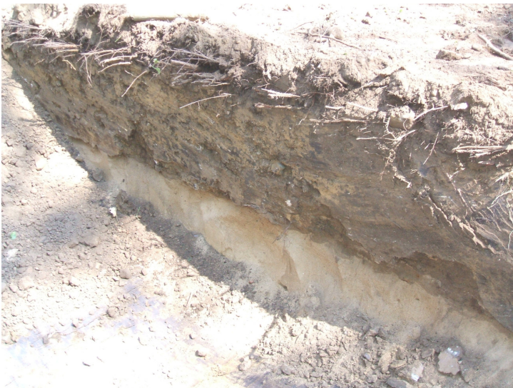
9/14/06: test trench 27 located just west of the concrete drive.