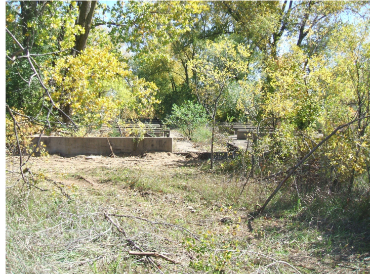
9/25/06: view facing east of concrete building remnants.