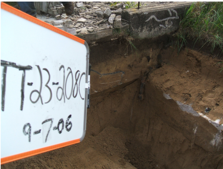
9/7/06: building footing along test trench 23 located along the central portion of the west building wall.