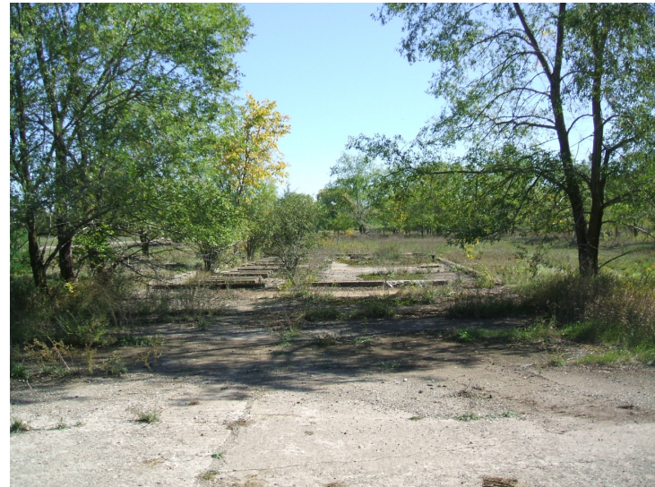
9/24/06: view facing east of concrete building pad.