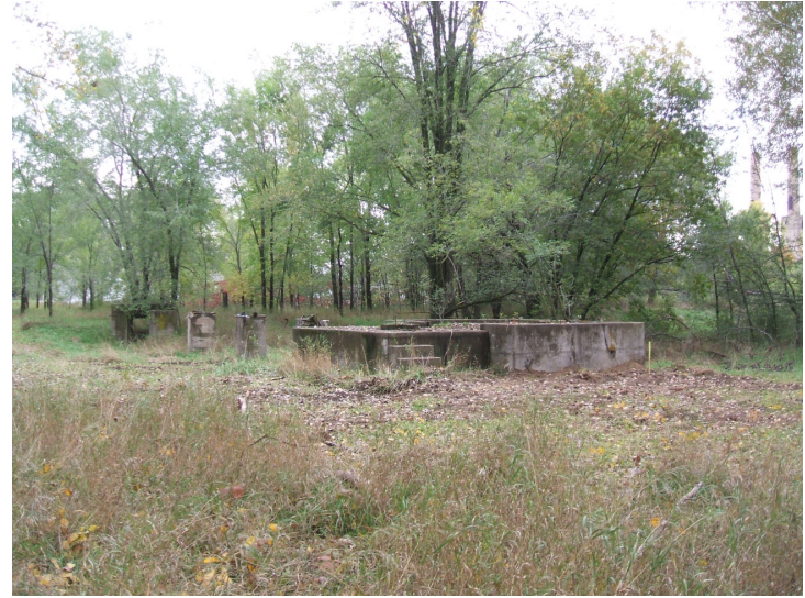
9/23/06: view facing northeast of the concrete building pad.