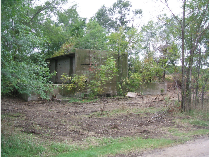
9/23/06: view facing northwest of concrete building remnants.