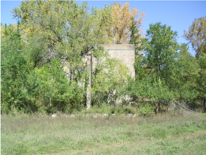
9/25/06: view facing north of building remnant.