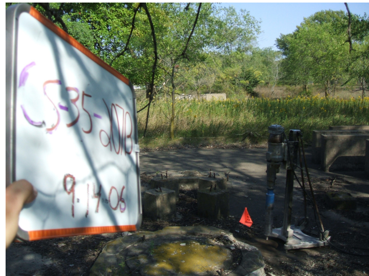
9/7/06: location of concrete sample 35 on the concrete building pad.