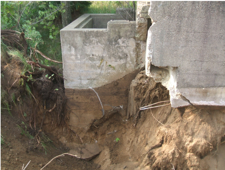
9/7/06: building footing along test trench 21 located on northeast corner of the building.