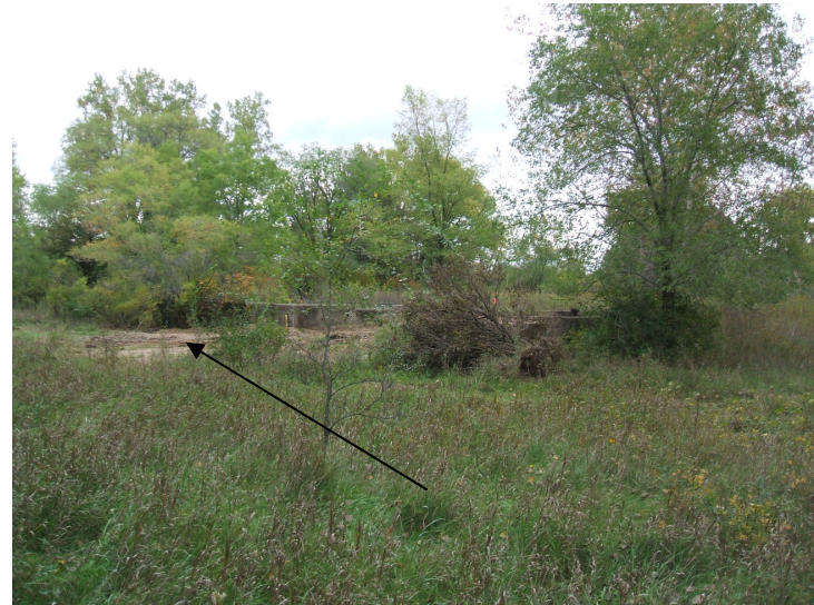
9/23/06: view facing northeast of the concrete building pad.