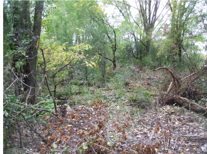
9/23/06: view facing northwest of foliage debris on top of the concrete building pad.