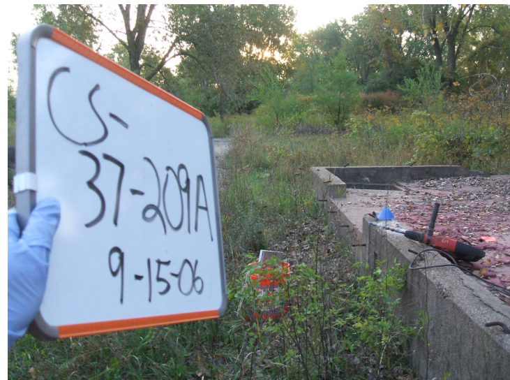
9/7/06: location of concrete sample 37 located on the edge of the building pad. Red mastic on top of concrete building slab.