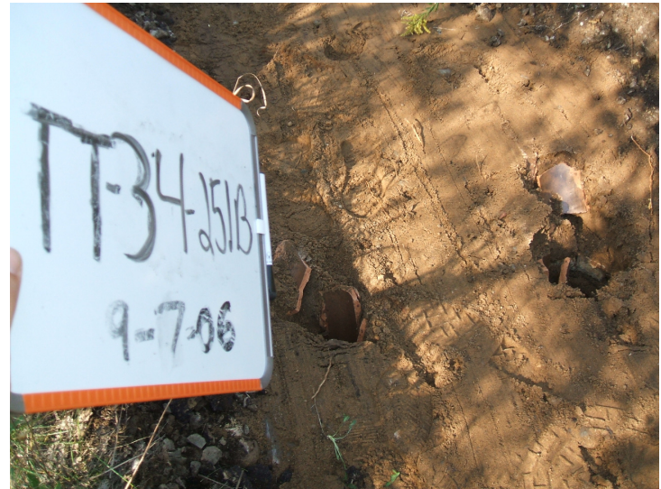
9/7/06: vertical clay pipes discovered in test trench 34 located east of TT-33 through former building slab.