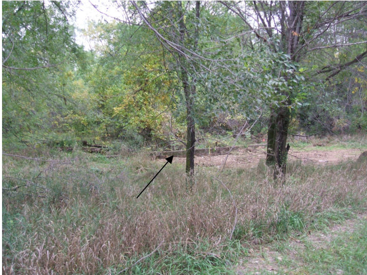
9/23/06: view facing northeast of concrete building pad.