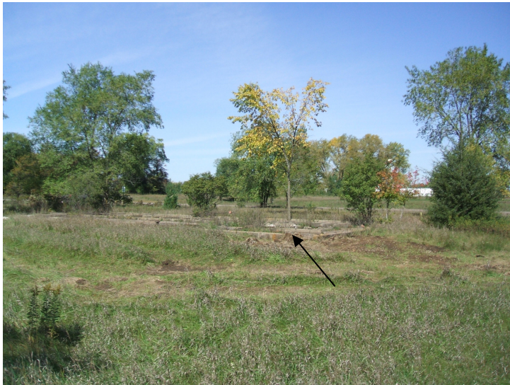
9/24/06: view facing northwest of concrete building pad.