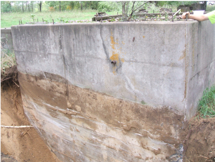
9/23/06: concrete footing along test trench 46 along south side of building.