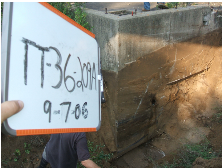
9/7/06: building footing along test trench 36 on the southwest corner of the building.