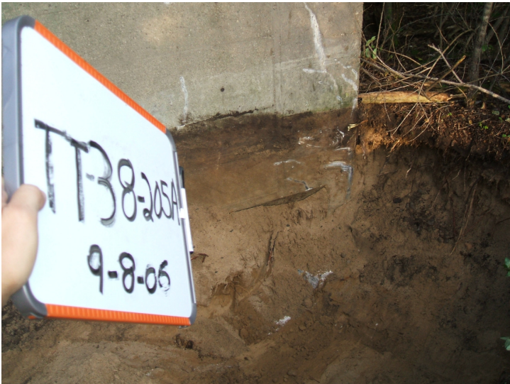
9/8/06: building footing along test trench 38 located on the north-east corner of the building.