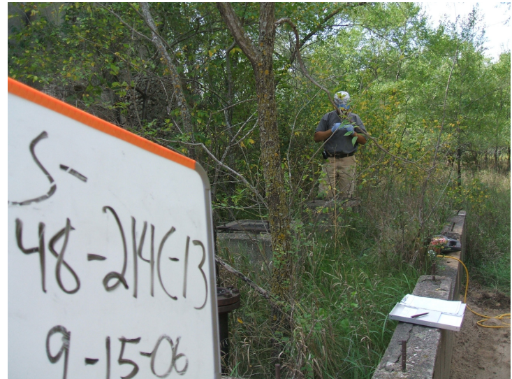
9/8/06: concrete sample 48 located on southwest area of building.