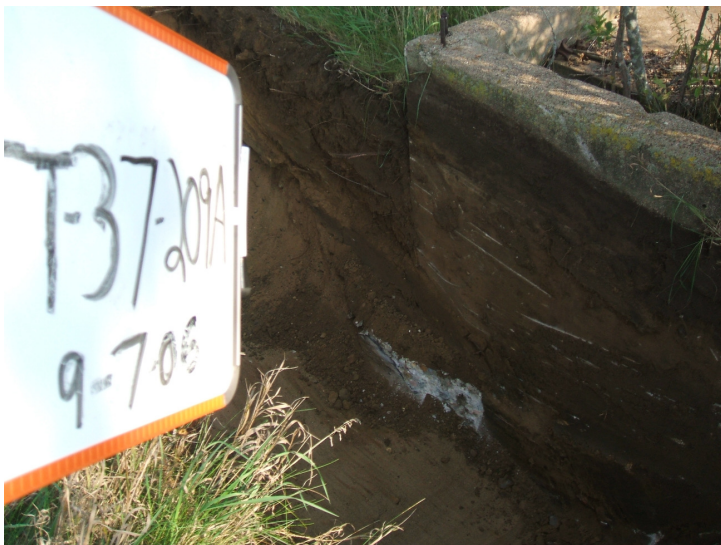
9/7/06: building footing along test trench 37 located on the north-east corner of the building (building number in photo is wrong).