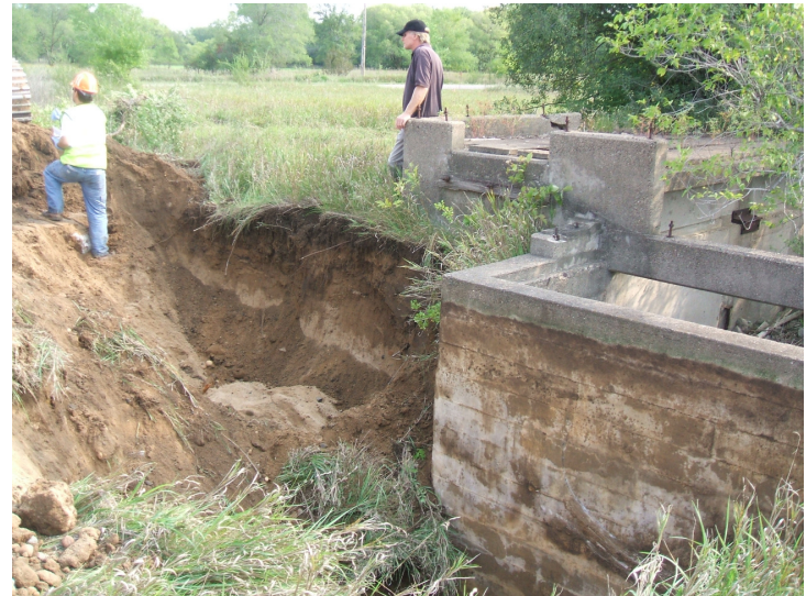
9/7/06: test trench 22 located along west building wall.