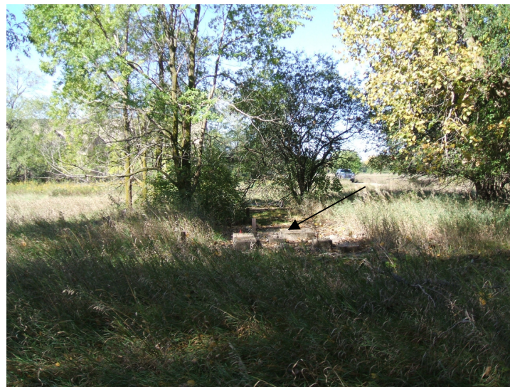
9/24/06: view facing west of concrete building pad.