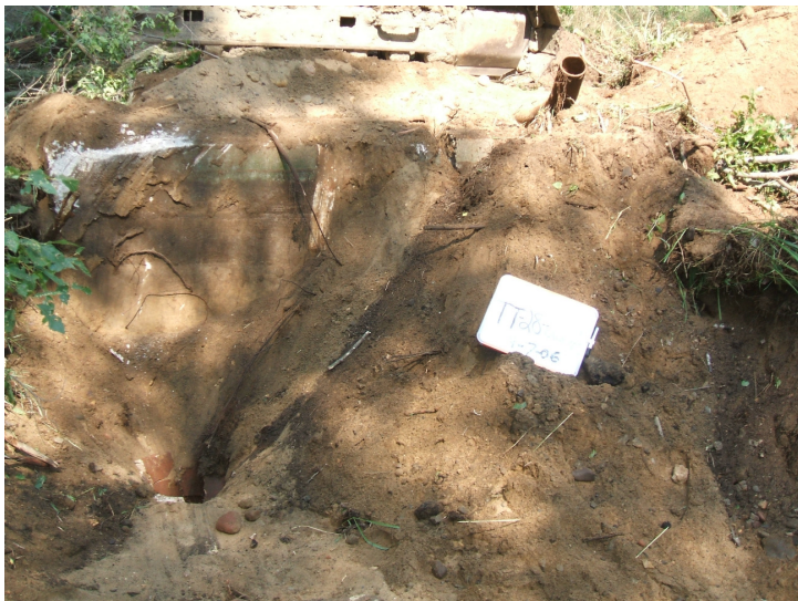
9/7/06: vertical pipe discovered in test trench 28 located along the western area of the southern building wall..