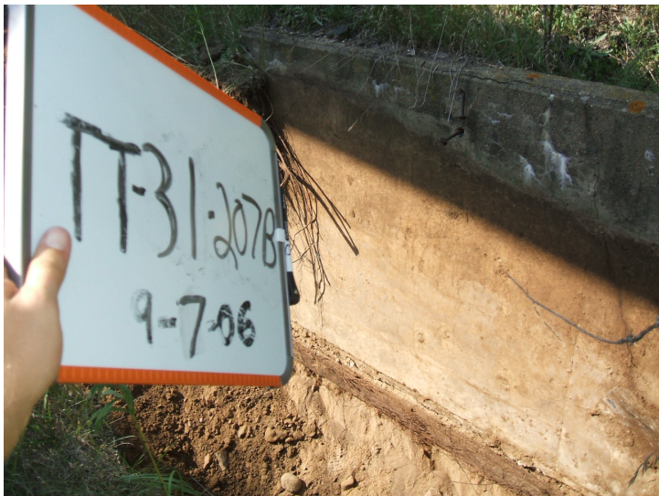
9/7/06: concrete footing along test trench 31 located along south-east corner of the building.