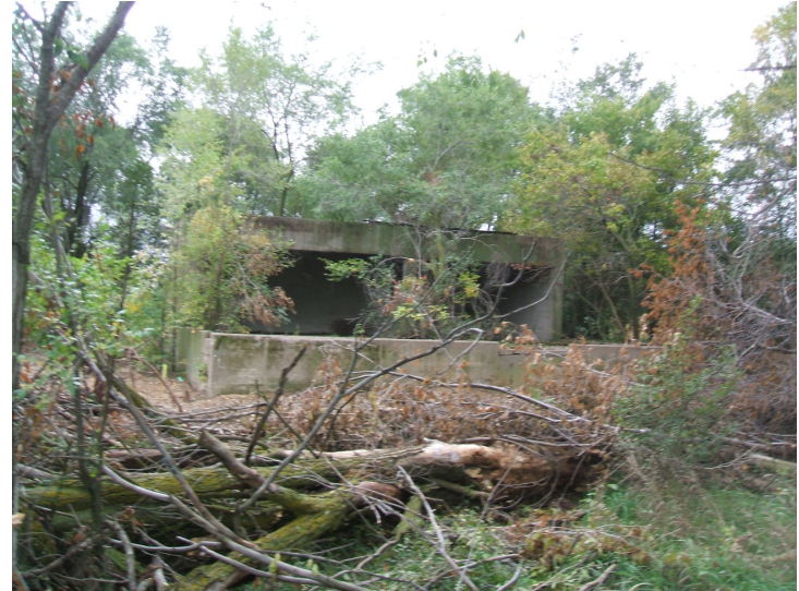
9/23/06: view facing south of concrete building remnants.