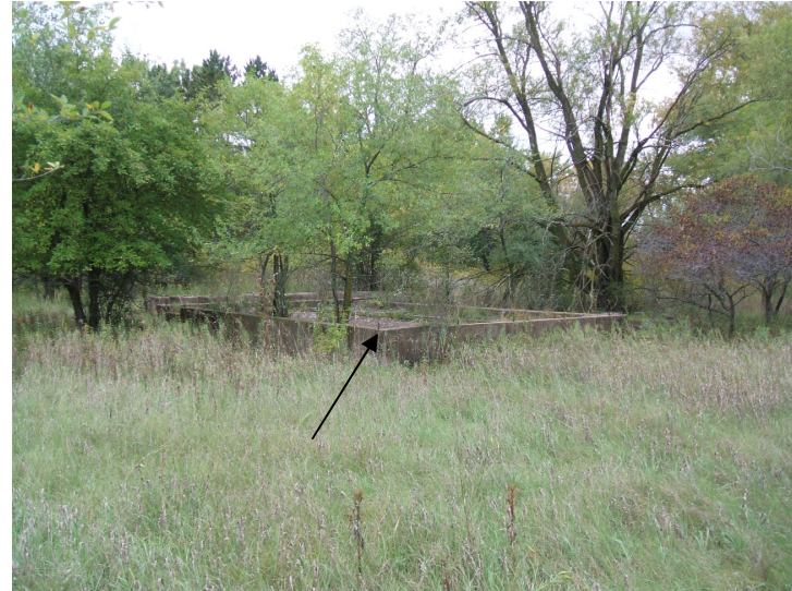
9/23/06: view facing southwest of the concrete building pad.