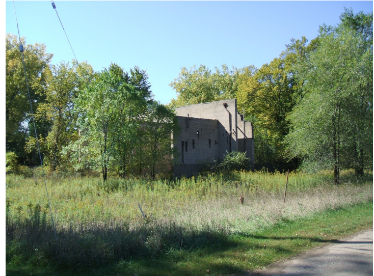
9/24/06: view facing southwest of building remnant.