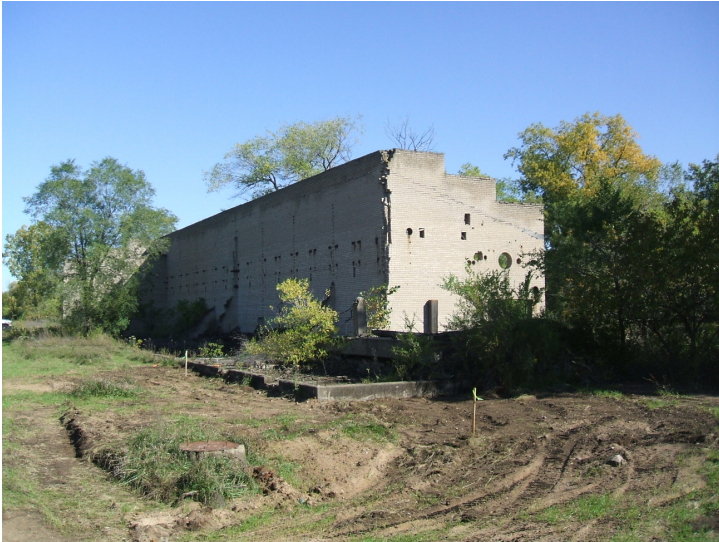
9/24/06: view facing northeast of building remnant.