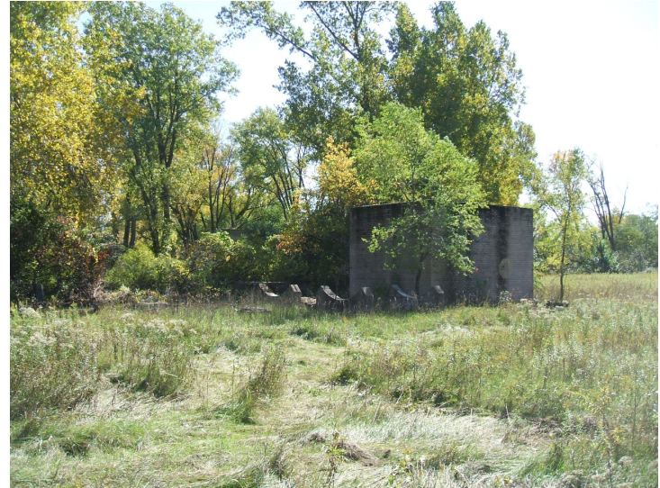
9/24/06: view facing southeast of a portion of the building remnant.