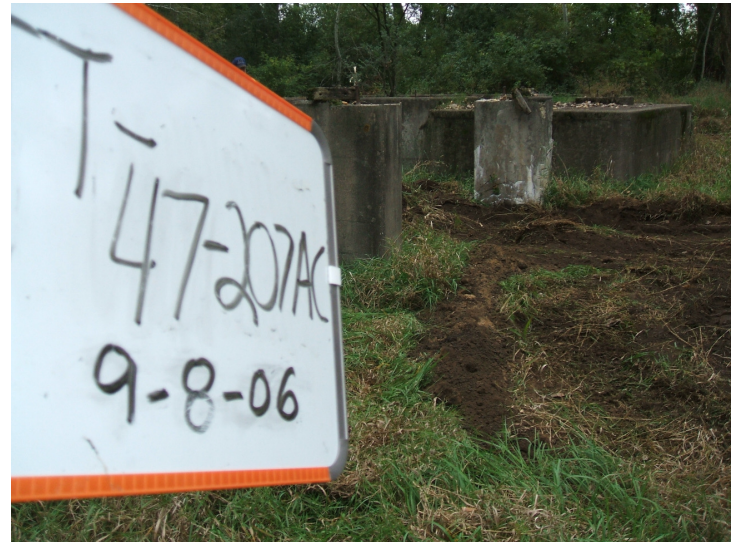
9/23/06: location of test trench 47 along the north side of the building.