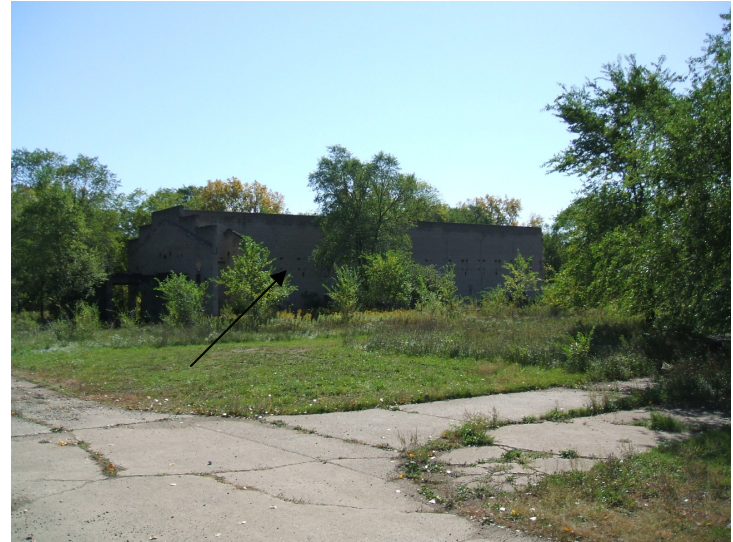
9/24/06 view facing southeast of building remnant.