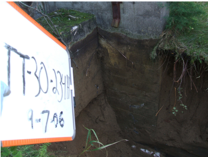
9/7/06: building footing along test trench 30 located along the central portion of the southern building well.