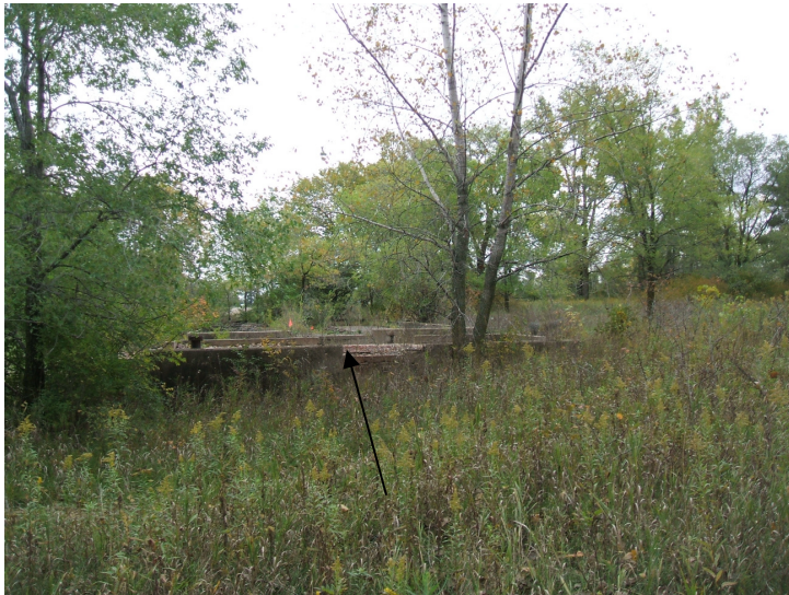
9/23/06: view facing north of the concrete building pad.