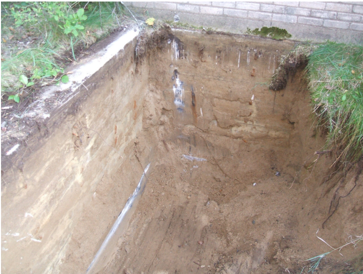
9/7/06: building footing along test trench 33 located east of the tank saddles.