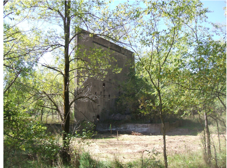
9/25/06: view facing southwest of building remnant.