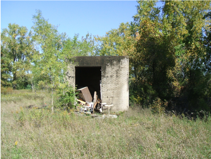
9/24/06: view facing north of a portion of the building remnant.