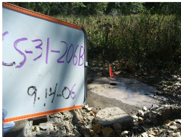
9/14/06: concrete sample 31 on the concrete building pad.