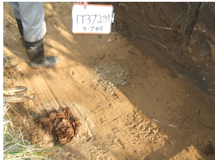
9/7/06: dry well discovered in test trench 37 located on the north-east corner of the building (building number in photo is wrong).