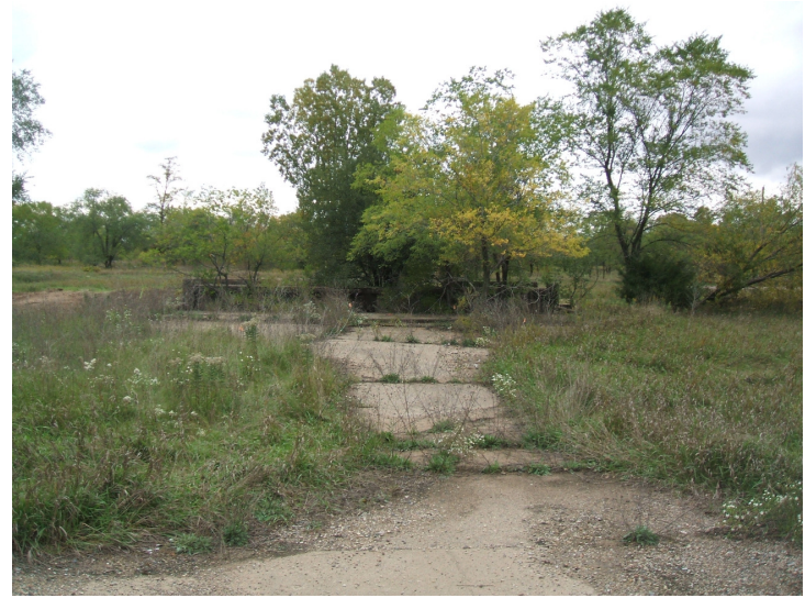
9/23/06: view facing north of concrete building pad.