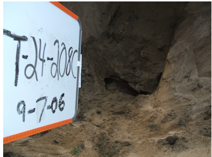
9/7/06: clay pipe discovered in test trench 24 located of the north-east corner of the building.