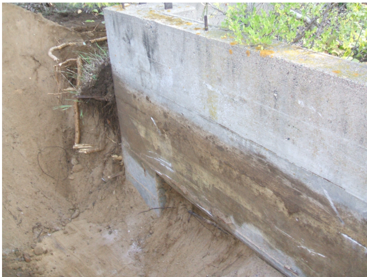
9/8/06: building footing along test trench 41 located on the northwest corner of the building.