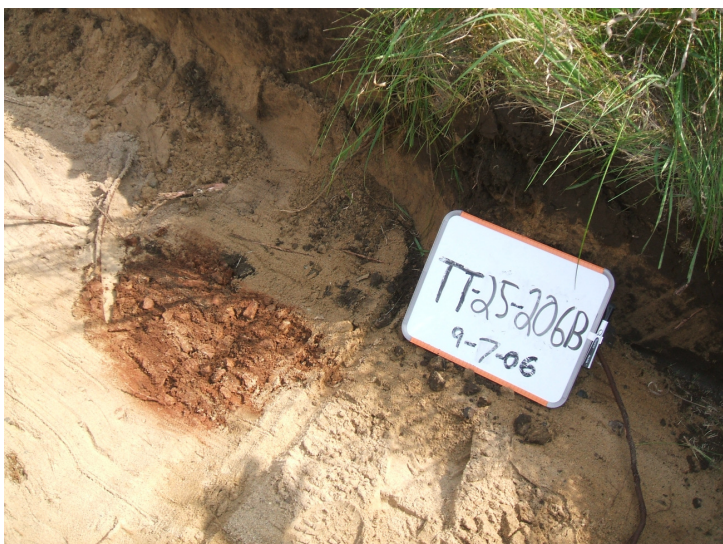
9/7/06: dry well discovered in test trench 25 located on southwest corner of the building.