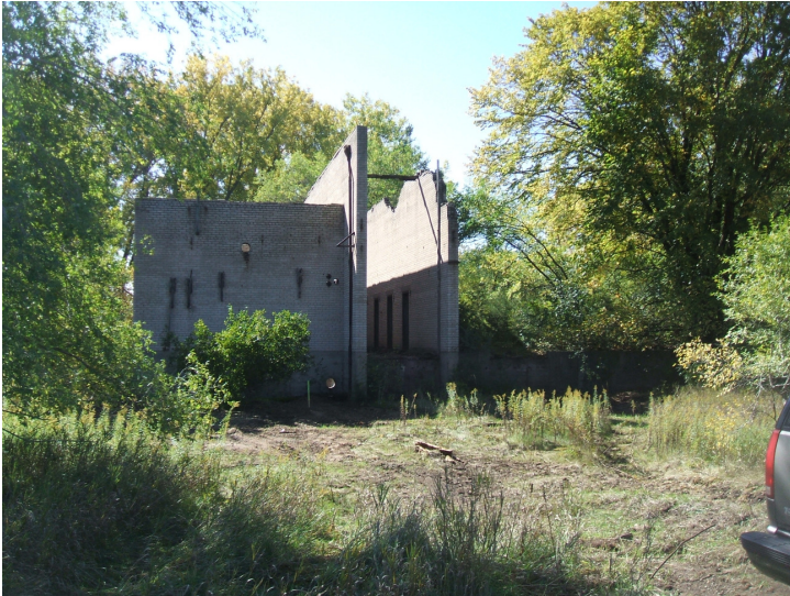
9/24/06: view facing south of building remnant.