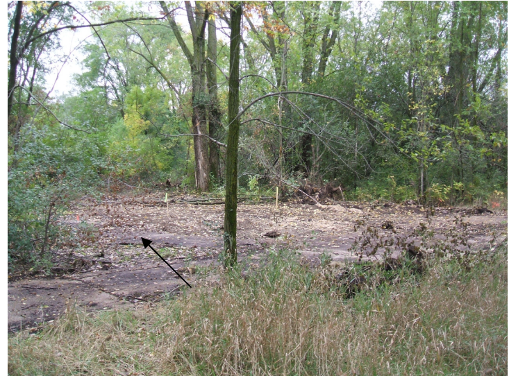
9/23/06: view facing southwest of concrete drive and test trench locations.